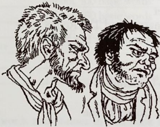
Jesse Hexam Rogue Riderhood