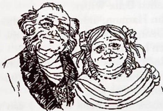
Noddy Boffin Mrs Boffin